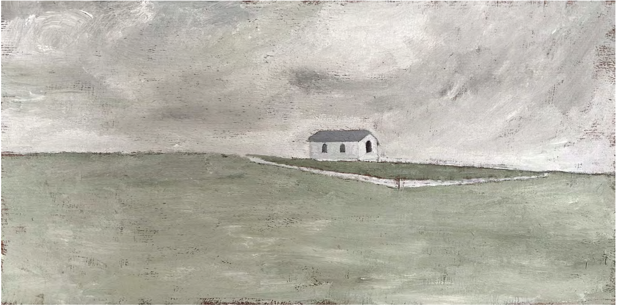
Campbell Town 1836

oil on cedar panel 14 x 28cm, framed in raw timber