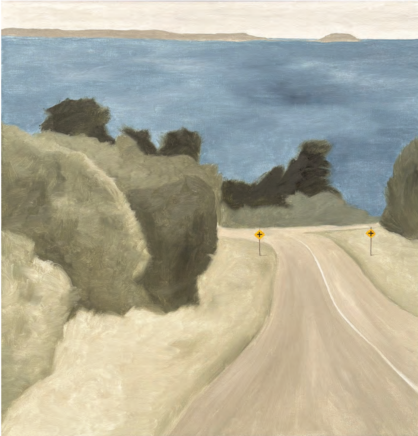
At the Crossing

oil on linen 76 x 71cm, (79 x 74cm framed in black stained timber)