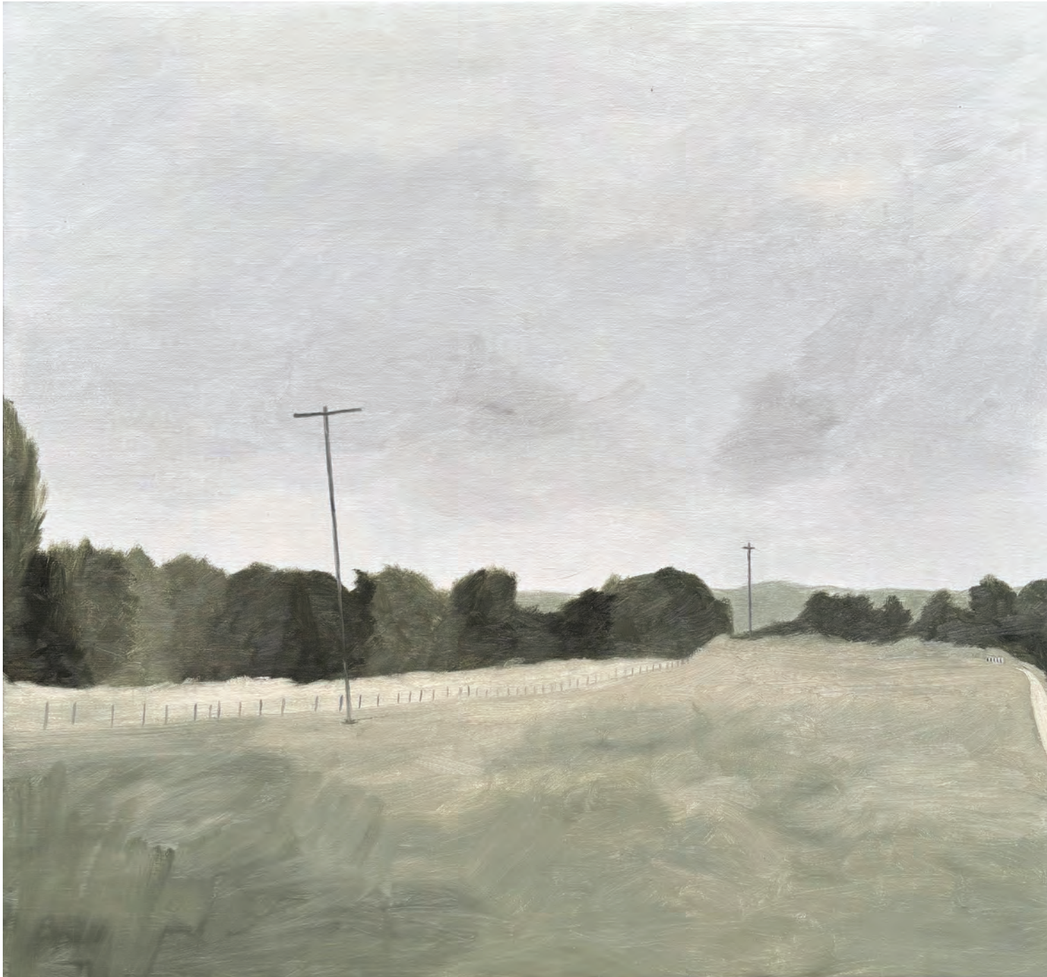
The End of the Road

oil on linen 71 x 76cm, (74 x 79cm framed in black stained timber)